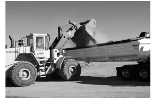
36 Cubic Yard Loading Capacity

Ranco reserves the right to change designs, materials and specifications without notice or incurring any obligation to such change.